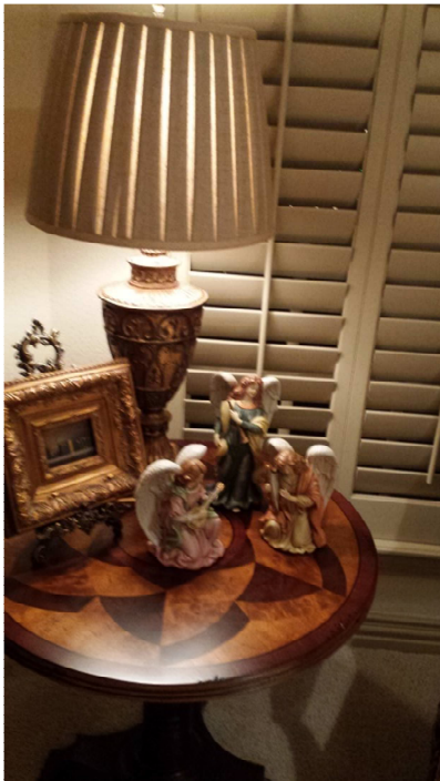
Christmas treasures from the Gribschaw home